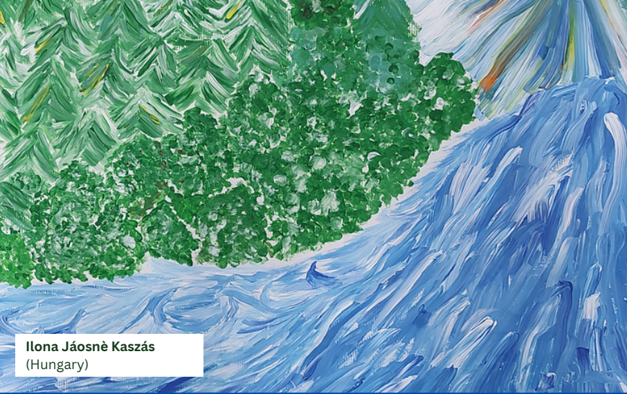
Ilona Jáosnè Kaszás (Hungary)